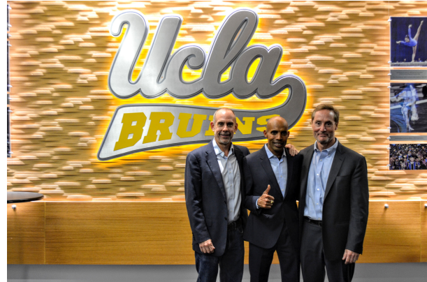
The TedXUCLA Eudaimonia speakers after the event.