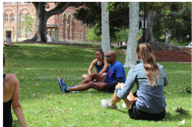
UCLA alumnus and Olympic athlete Meb Keflezighi leads UCLA students, faculty, and staff in a series of stretches.

To provide an intimate experience between Meb and the UCLA community and integrate with the efforts of MoveWell, Bruce Chorpita organized a small run-clinic on UCLA's campus. Meb led participants in a series of drills and gave tips on form and posture, turnover, and stretching. A small group of students, staff, family, and friends of UCLA participated. Students included members of the cross-country team and HCI's FITWELL team.