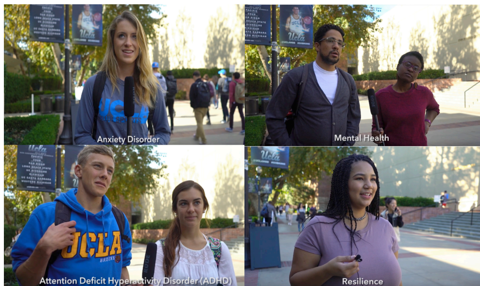
UCLA students give their best guess on what common mental health terms mean.