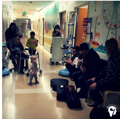
Mindful musicians perform in the Pediatric Unit of the UCLA Medical Center, Santa Monica as part of the bedtime lullaby series.

Established in the School of Nursing foyer, this new series encourages students and staff to take a break in a more intimate setting. The 30-minute performances are arranged in the spirit of a fireside chat, to make space for attendees to interact with musicians in between the music. These were held twice per quarter, for a total of six performances in the 2016 - 2017 academic year.