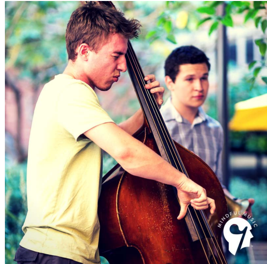
Mindful Musicians play in the open air on UCLA's campus.

In Spring 2017, the Student Activities Center began renting out blue loungers students can fill with air and use to relax, lounge, nap, and/or enjoy the sun and green space of the UCLA campus. You can often see them scattered on the hill between Powell Library and Bruin Walk.