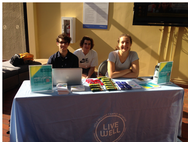
MindWell volunteers table in the John Wooden Center for the Mind Lexicon Survey.